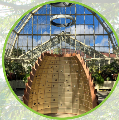
1. Artist: Rachel Doolin Title: Seedarium

How many different seeds can you recognise in the Seedarium? Why would it be important to collect and store seed? Do you know where there might be any seed banks located around the world or even close by?