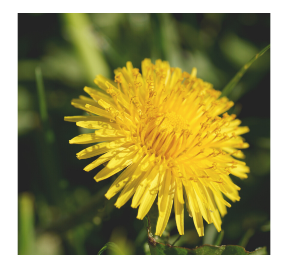
A yellow flower