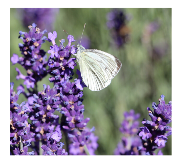
A flower that insects like