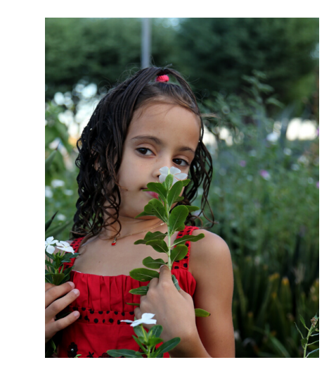
A plant that smells nice