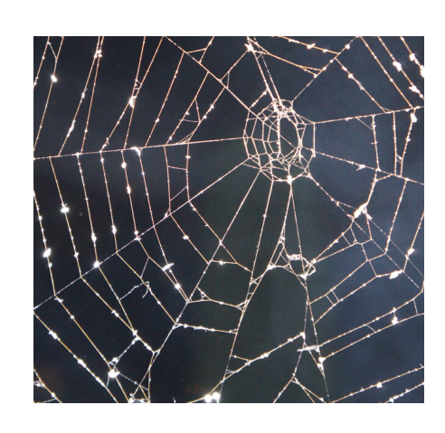
A spider web