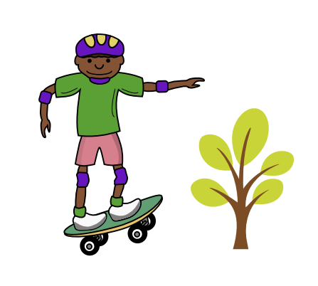
A tree smaller than yourself