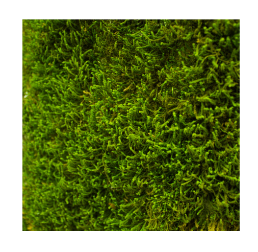
( ) Moss