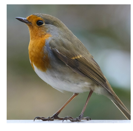
Stay really quiet. Look around you, how many birds can you count? Do you know any of their names?