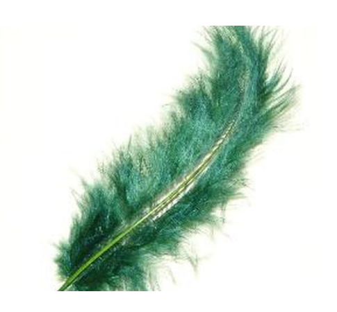
A plant that has feathery leaves