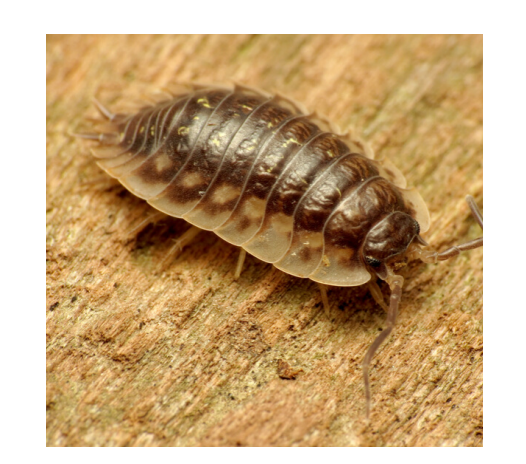
A woodlouse hint: they live under old rotting wood and stones