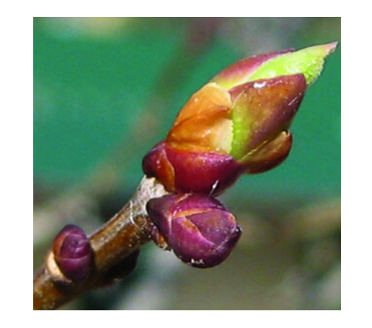
A leaf bud that is about to open