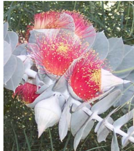
Eucalyptus macrocarpa #6

Australia is a remarkably arid country, but also has a great diversity of habitats, from the alpine forests of Tasmania, to the tropical rainforests of northern Queensland. The flora around Perth, Western Australia is one of the most diverse floras on earth. More than 80% of the species being found nowhere else, and indicate its long isolation from other areas. The development of the dry sclerophyll (hard-leaved) vegetation of Australia and the Fynbos vegetation of South Africa are examples of parallel evolution under similar climatic conditions on soils with low-nutrient status. Some of the more characteristic Australian plants are the Eucalypts (#6 & #16) Wattles ( Acacia #35), Tea-trees ( Melaleuca , the source of the oil - #10) and Grass trees (Xanthorrhoea #3).